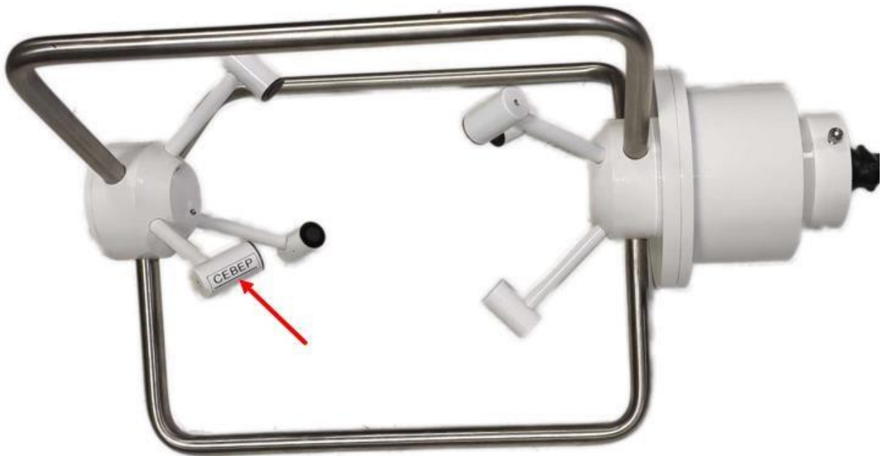
Figure 2 Special sticker – north line

To accurately determine wind direction, this line on the sticker on the sensor body must point to true north, previously determined using an accurate directional measuring device (such as a compass). After this, the sensor must be secured.