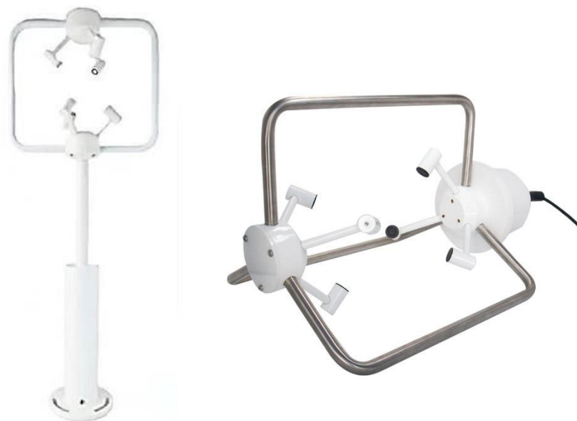
Figure 1. External appearance of the ultrasonic three-dimensional wind sensor PRO 200Z